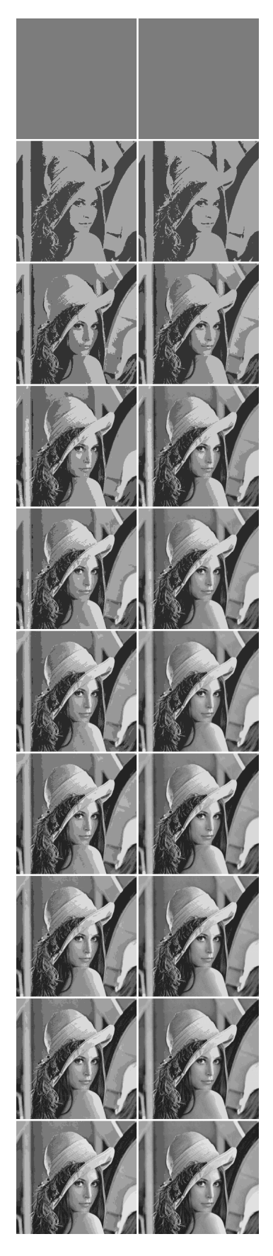
Fig. 2. Sequences of optimal (left) and superpixel (right) approximations of "Lena" image.

Pattern \ Recognition \ and \ Information \ Processing \ (PRIP'2021): Proceedings \ of \ the \ 15 th \ International \ Conference, \ 21-24 \ Sept. \ 2021, \ Minsk, \ Belarus. - \ Minsk : UIIP \ NASB, \ 2021. - \ 246 \ p. - \ ISBN \ 978-985-7198-07-8.